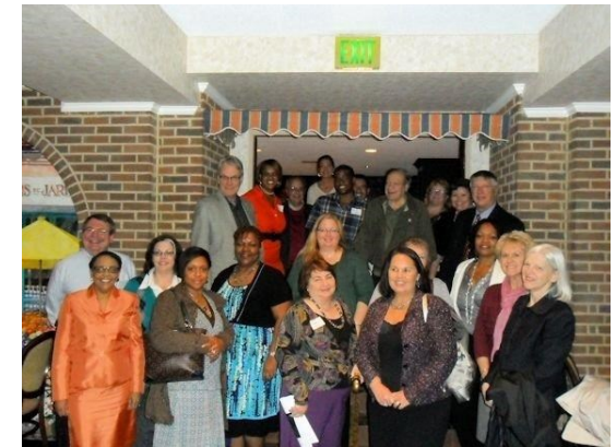
The Tidewater Chapter celebrates their 40th Anniversary November 2012